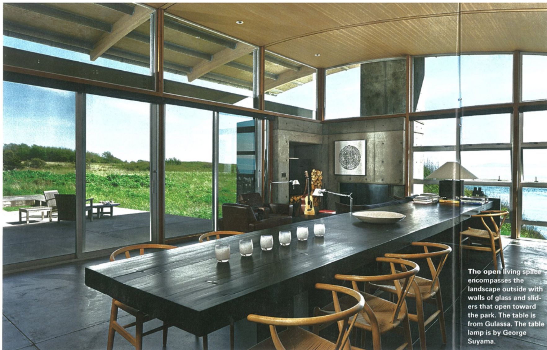
The open living space encompasses the landscape outside with walls of glass and sliders that open toward the park. The table is from Gulassa. The table lamp is by George Suyama.

Closets are hidden along the entrance hall to the home, which features heated concrete floors. The tunnel-like entry is an intimate transition between the elements outside and the wide-open space beyond.