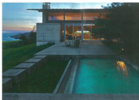
Steppingstones, set before a water feature, provide a pathway from the main house to the guest bunker.