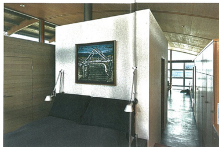
The master bedroom sits tucked behind a cube that holds the bathroom and offers separation from the rest of the home.

But that was then. And this, this sculpture of a home in concrete, blackened steel, gray-washed cedar and zinc, is now. The concrete wall that runs the length of the home (and beyond) shielding views of nearby neighbors. Walls of glass to the east and south catching water and meadow. Long, open living space separated from the bedroom by a white cube (containing the bathroom). The living space dominated by a contemporary king's table 20 feet ▶